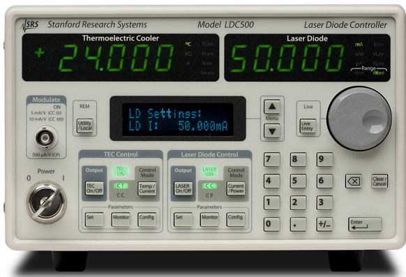
LDC500 front panel

The LDC500 series offers an auto-tuning feature which automatically optimizes the PID loop parameters of the controller. Of course, full manual control is provided too. Dynamic transfer between CT and CC modes for the TEC is also easy — just press the Temp/Current button.